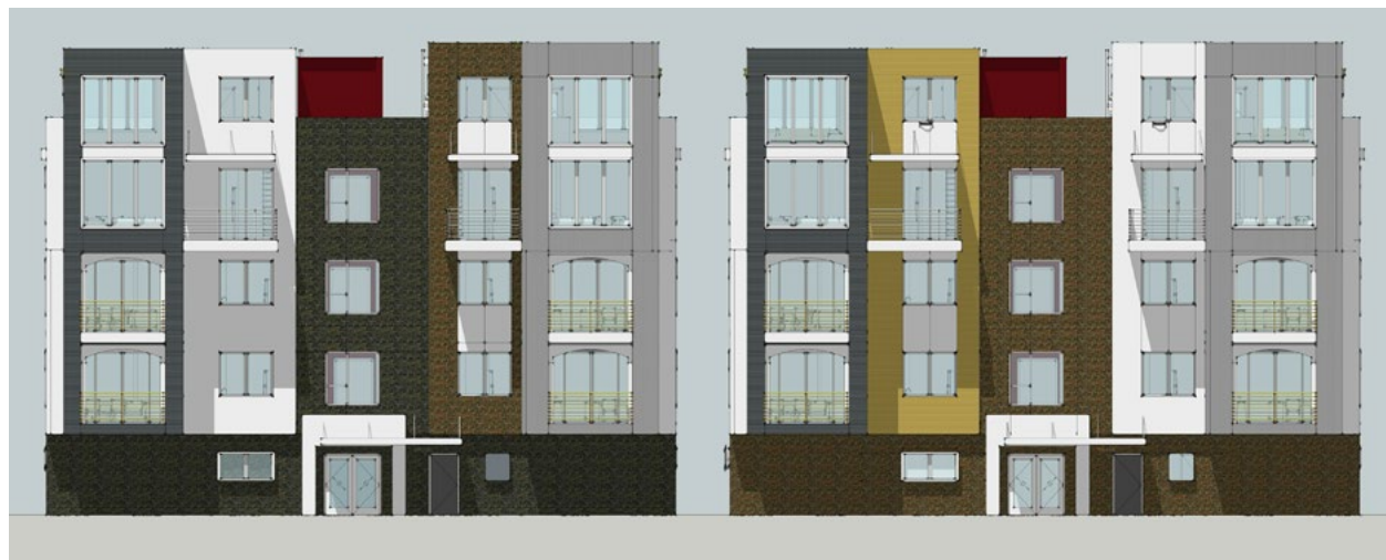
Elevation Option A